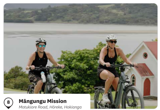
8 Māngungu Mission Motukiore Road, Hōreke, Hokianga