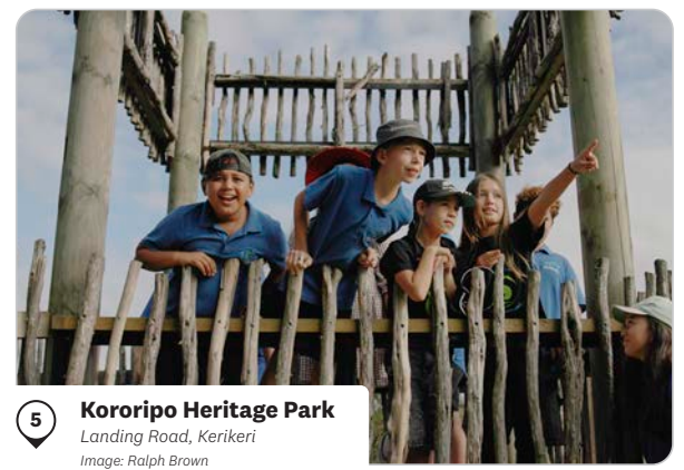
5 Kororipo Heritage Park Landing Road, Kerikeri