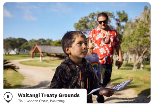
6 Waitangi Treaty Grounds Tau Henare Drive, Waitangi